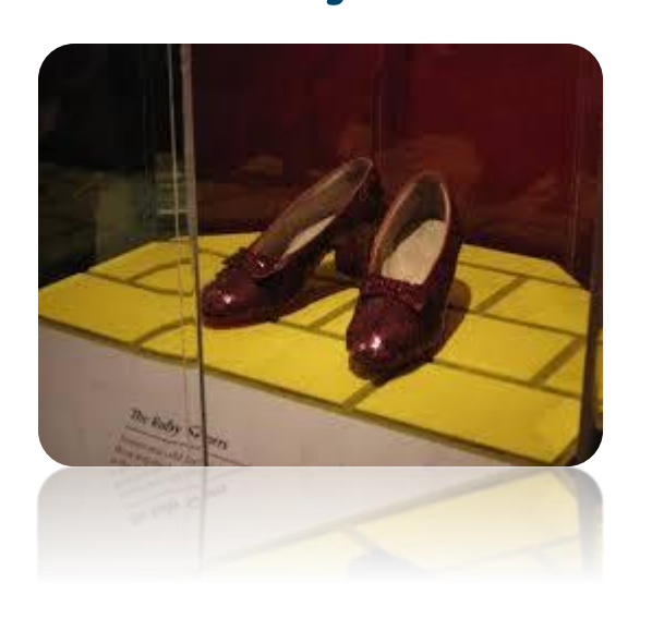
U.S. History Museum