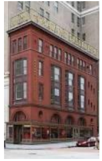
Madame Tussauds Wax Museum