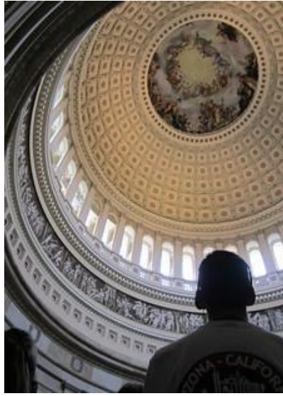
National Art Museum