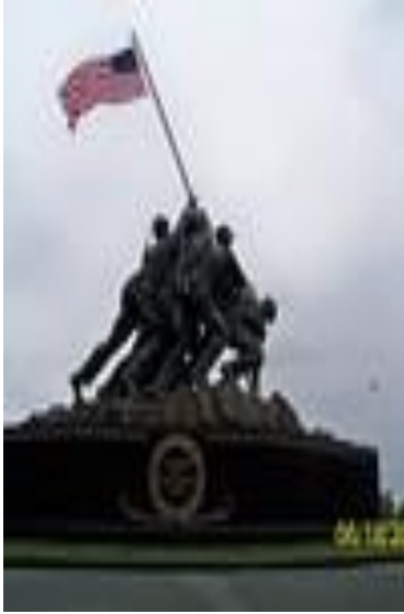
Iwo Jima Memorial